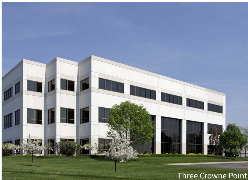
Three Crowne Point

Visit the website NorthernLightsDistrict.com to learn more about the exciting progress taking place and to see plans for the very near future.